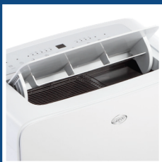
Flap motorizzato Auto-opening flap