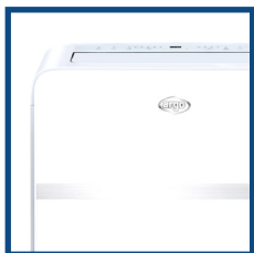
Cura dei dettagli Attention to details