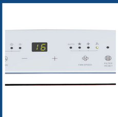
Pannello comandi digitale con display a LED Digital control panel with LED display

ARGO ORION PLUS is the air conditioner with a contemporary design. The glossy front panel, highlighted by a silver belt, is the result of fashion and interior design contaminations. Thanks to its heat pump, ARGO ORION PLUS is useful all year round.